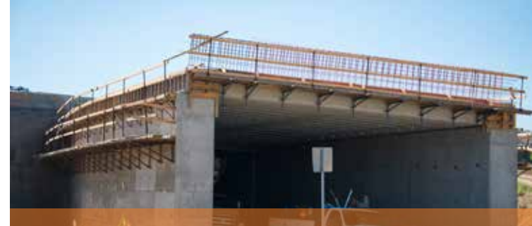
RTD Bus Tunnel, south of 120th Avenue

Big Dry Creek Bridge, south of 136th Avenue